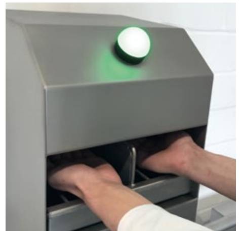
Contactless hand disinfection