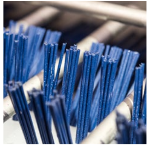
Stable nylon brushes