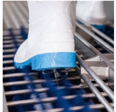
Hygienic wet cleaning