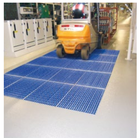
ProfilGate® fitted for vehicles is available as well