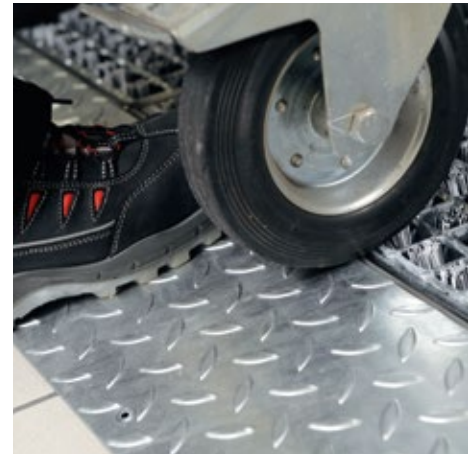
Handcarts can pass also

More detailed information and additional models are available in our ProfilGate® catalogue or on our website www.profilgate.com