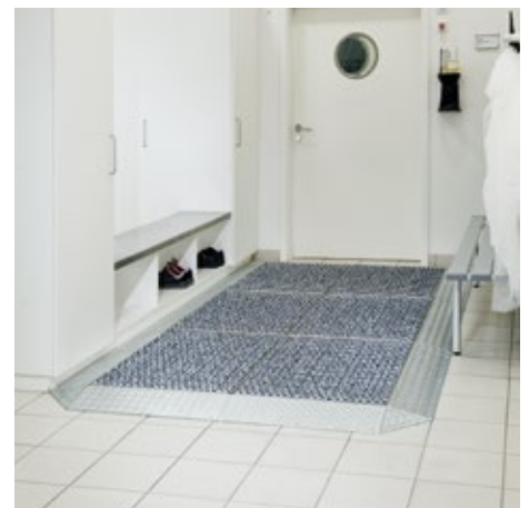
ProfilGate® go with revolving ramps